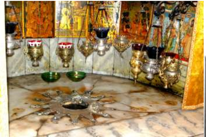
Church of the Nativity in Bethlehem